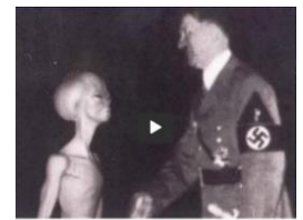
— REPTILIAN GREY & ADOLF HITLER