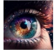
SEE WITH THE EYES OF YOUR HEART ❤️

Rainbow Children are the most current wave to hit the Earth. They haven't all been born yet. They are just starting to hit the Earth. The best way to describe these little souls is pure love. Rainbow and Crystals have a thinner veil than the rest of us – probably did. So, they come in less polaroid - higher vibrating – and more in touch with their true nature. They are teaching us to share unconditional love to elevate the energy and enter the new age of this planet. Their mission is to heal humanity by revitalizing humanity with a loving higher consciousness. They are born with super high dimensional consciousness so that they can impart love, empathy and peace from the moment of their arrival. They will probably also be drawn to a vegan and vegetarian diet, be very environmentally conscious, service-oriented, very trusting, and will probably have a lot of psychic gifts. They are sensitive and most are empaths, so they feel things that are said and done in a way that previous generations didn't – not as much. They are most in touch with their higher selves so when something isn't nicely said -- they feel it. They get triggered more easily but that comes with the territory.