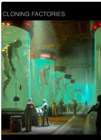
- CLONING FACTORIES - https://t.me/QSPARTANWARRIORS