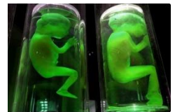
- IF U KNOW U KNOW - UNDERGROUND HYBRID CLONING FACTORIES - JOIN: https://t.me/QSPARTANWARRIORS

A Hybrid is the offspring of two animals or plants of different breeds, varieties, or species especially as produced through human manipulation for specific genetic characteristics. Many believe there are many Hybrid people in this country. Many Hybrid children were rescued alongside other children nationally and internationally from the caves and tunnels by the Military and Earth Alliance . They even put out a TV series called " Sweet Tooth " to educate the public about these Hybrid children so that when they see one, they would not freak out.