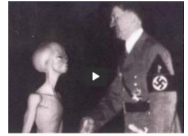
Reptilian Grey & Hitler — REPTILIAN GREY & ADOLF HITLER

you. Again, those ETs that were born on Earth are already here. There have been many sightings on people's ring.com door cameras but they are not here to hurt us. Many were born on Earth, so they weren't forced to leave their homes. Remember the Galactic Federation got rid of the evil Tall Greys and Draco Reptilians .