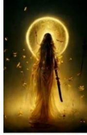
♥♥♥♥♥ We are Warriors, and we came to change the world. 🌟

the statement “I came through my parents, but I am not of my parents?” I don’t look like anyone in my family, and I often wondered if I was adopted. If you grew up looking up at the sky and wanting to go home, this is because you are a #StarSeed from many galaxies away.